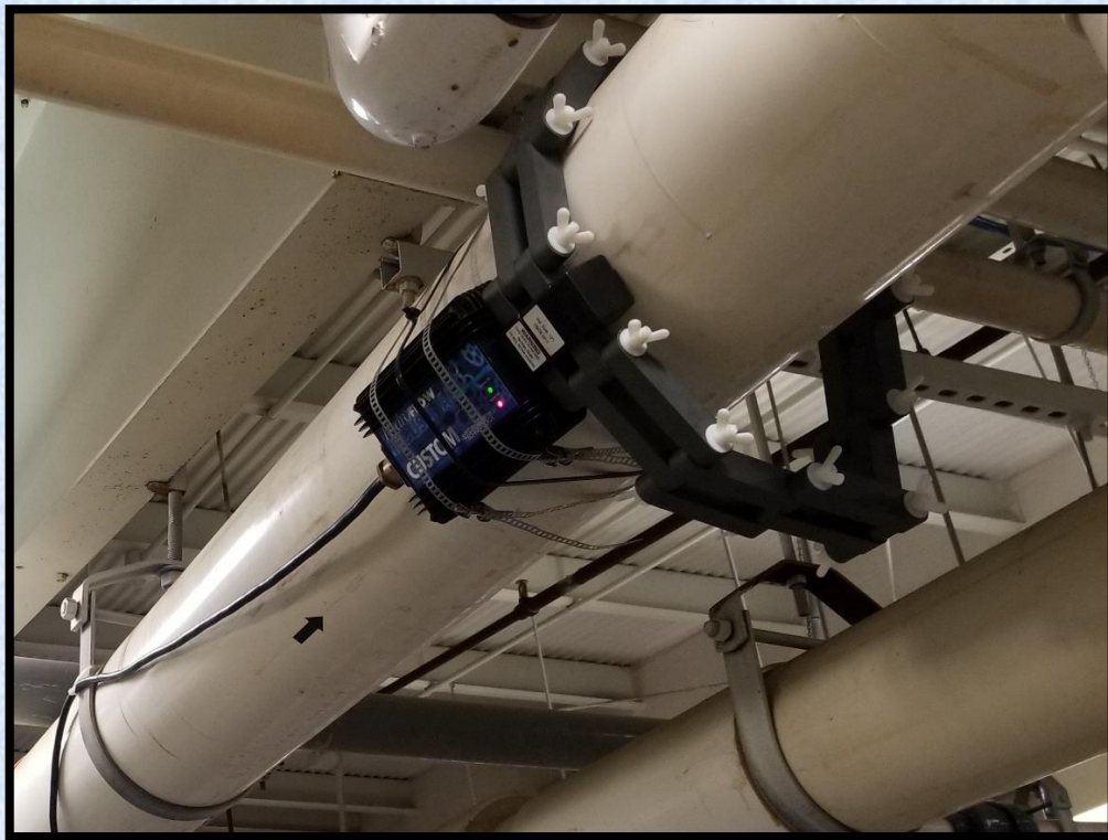
Installed HydroFLOW device

Upon installation, the Hydropath signal began to propagate throughout the recirculating pool system. Clear signal readings were observed at the surge tank, the pool, the filters and the heat exchanger.