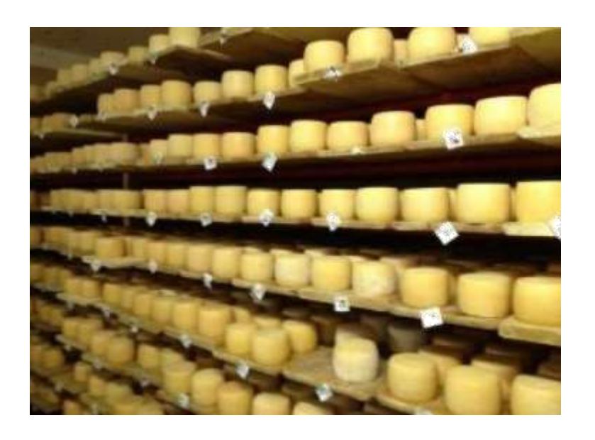
Test of HydroFLOW unit on Rozhyshche cheese.